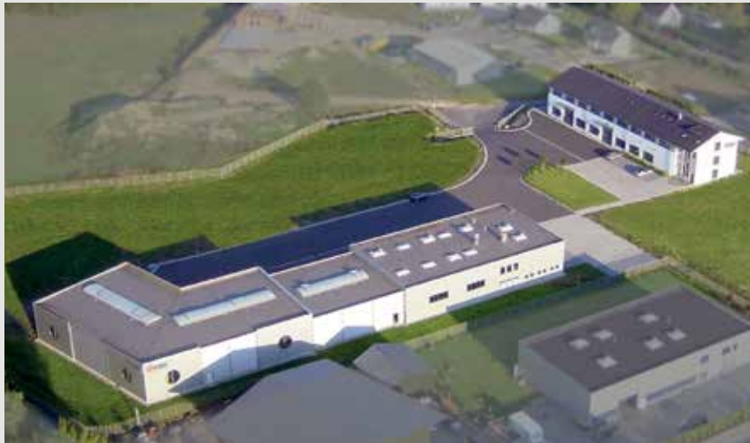
Plant Nümbrecht - Germany